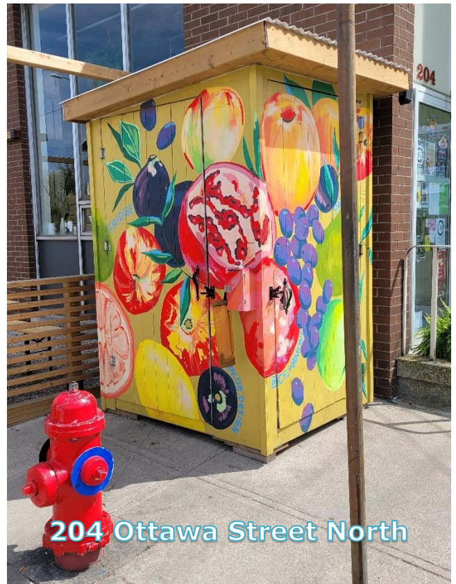
204 Ottawa Street North

People can leave fresh/packaged food and non-perishable food, as well as hygiene or other needed supplies (diapers, formula, etc.) in a public fridge/pantry area.