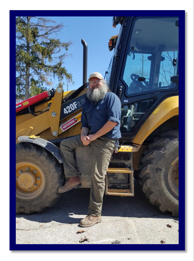
In his own words

Hi Union Brothers and Sisters. I've been asked to write about myself, apart from my job as an equipment operator at the Royal Botanical Gardens.